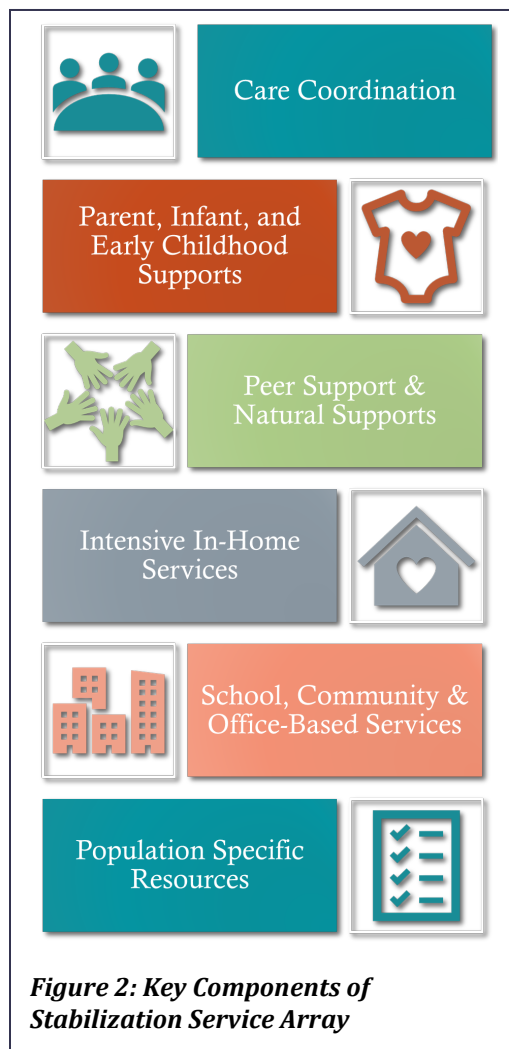
Figure 2: Key Components of Stabilization Service Array

When considering, selecting, and referring a youth and family to services, including evidence-based practices † , providers should consider the cultural humility and linguistic competency of programming and the fit of the intervention with the strengths, needs, and goals of the youth and family. State and localities are encouraged to adopt consistent training for all providers serving children, youth, and families. In addition to training on child and youth development, the adolescent brain, and trauma-responsive systems, communities can provide training on how data can inform continuous quality improvement; workforce development to eliminate the use of seclusion and restraint; how to establish a performance improvement team with non-tokenized roles for youth and families; and the importance of youth- and family-centered care, respect, and dignity. Family, youth, and other team members should be active participants in making decisions about the transition from stabilization services to ongoing services.